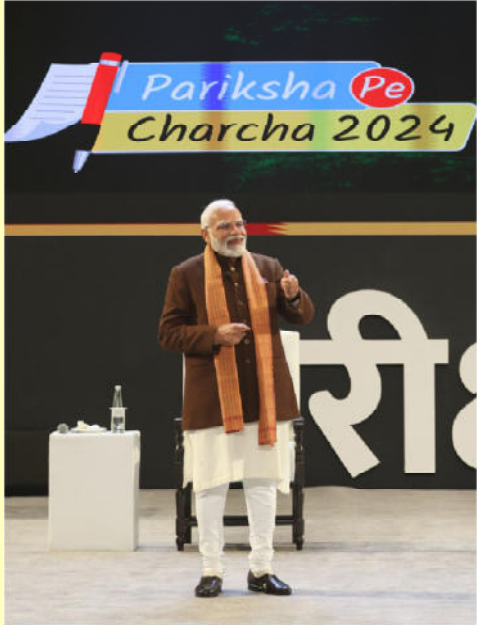
and discussed the future of the world.

New Delhi, Jan. 29 (PIB) The Prime Minister, Shri Narendra Modi interacted with students, teachers and parents at Bharat Mandapam in New Delhi today during the 7th edition of Pariksha Pe Charcha (PPC). He also took a walkthrough of the art and crafts exhibition showcased on the occasion. PPC is a movement driven by Prime Minister Shri Narendra Modi's efforts to bring together students, parents, teachers and society to foster an environment where each child's unique individuality is celebrated, encouraged and allowed to express itself fully. Addressing the gathering of students, teachers and parents, the Prime Minister mentioned the creations by the students in the exhibition where they have expressed aspirations and concepts like New National Education Policy in various shapes. He said these exhibits reflect what the new generations think about various topics and what solutions they have for these issues. Starting his interaction, the Prime Minister explained the importance of the venue, i.e. Bharat Mandapam to the students and told them about the G20 summit where all the major leaders of the world assembled